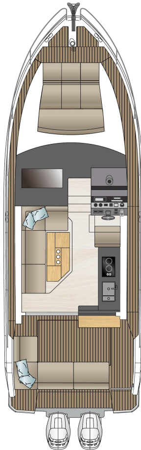
MAIN DECK standard