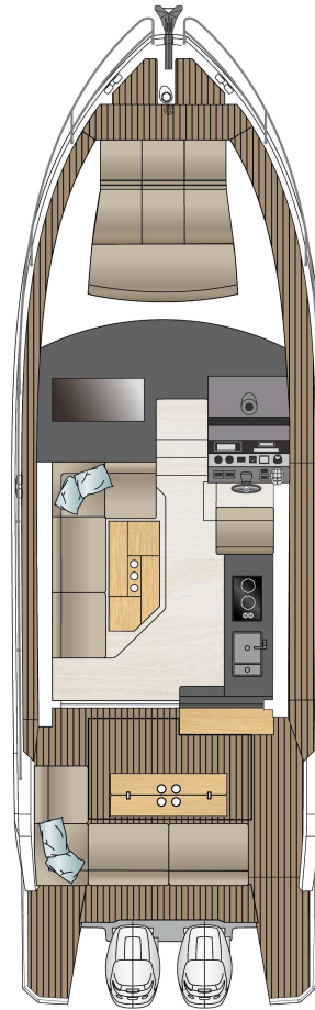
MAIN DECK optional